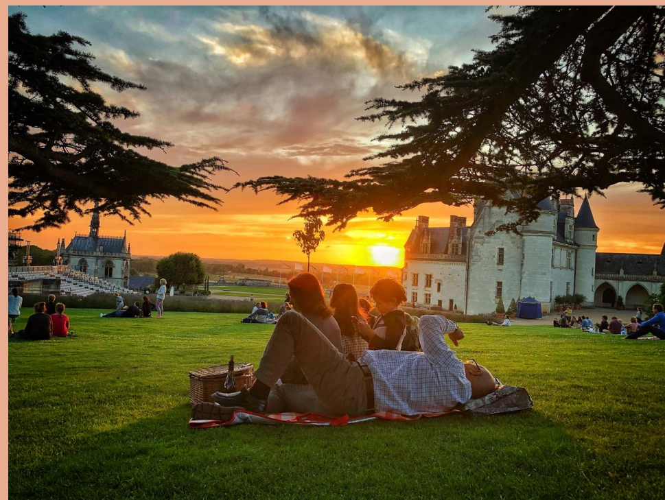
Château of Amboise

On July 16, 30, August 6 and September 3