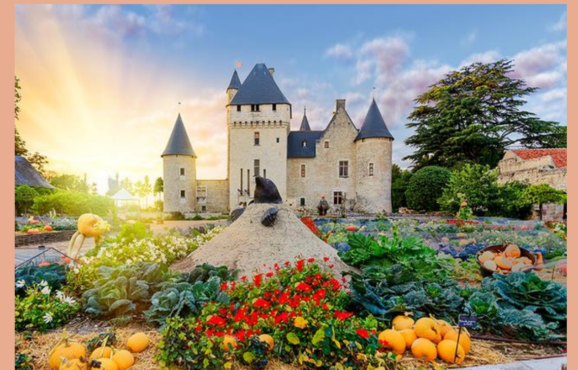
Château of Rivau

The château offers the possibility to sleep in one of the 7 luxury rooms hidden in the heart of the estate