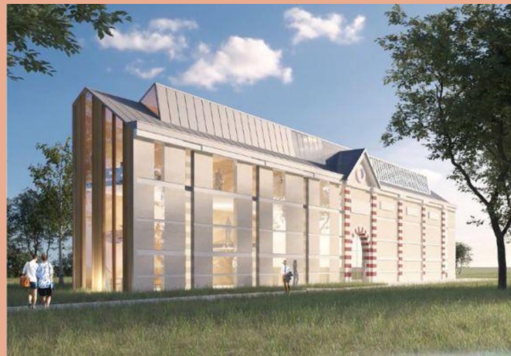
Château of Clos Lucé

An immersive experience to discover the creative process of the artist thanks to digital technologies.